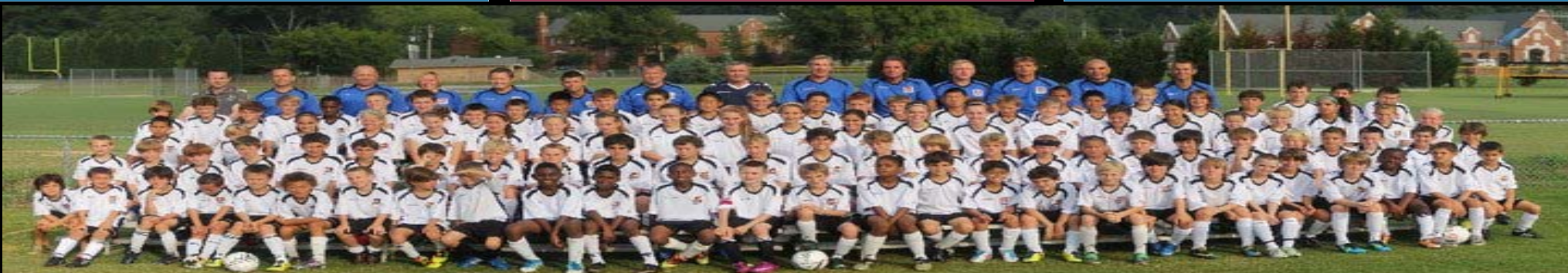
West Ham United International Academy 2011 National Camp